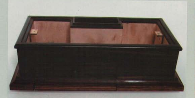
The wooden base constructed for the clock. It is constructed from veneered plywood and hardwood mouldings.