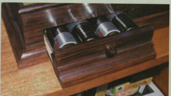
A drawer to the front houses the dry cells which supply power to the Archimedes screw drive motor.