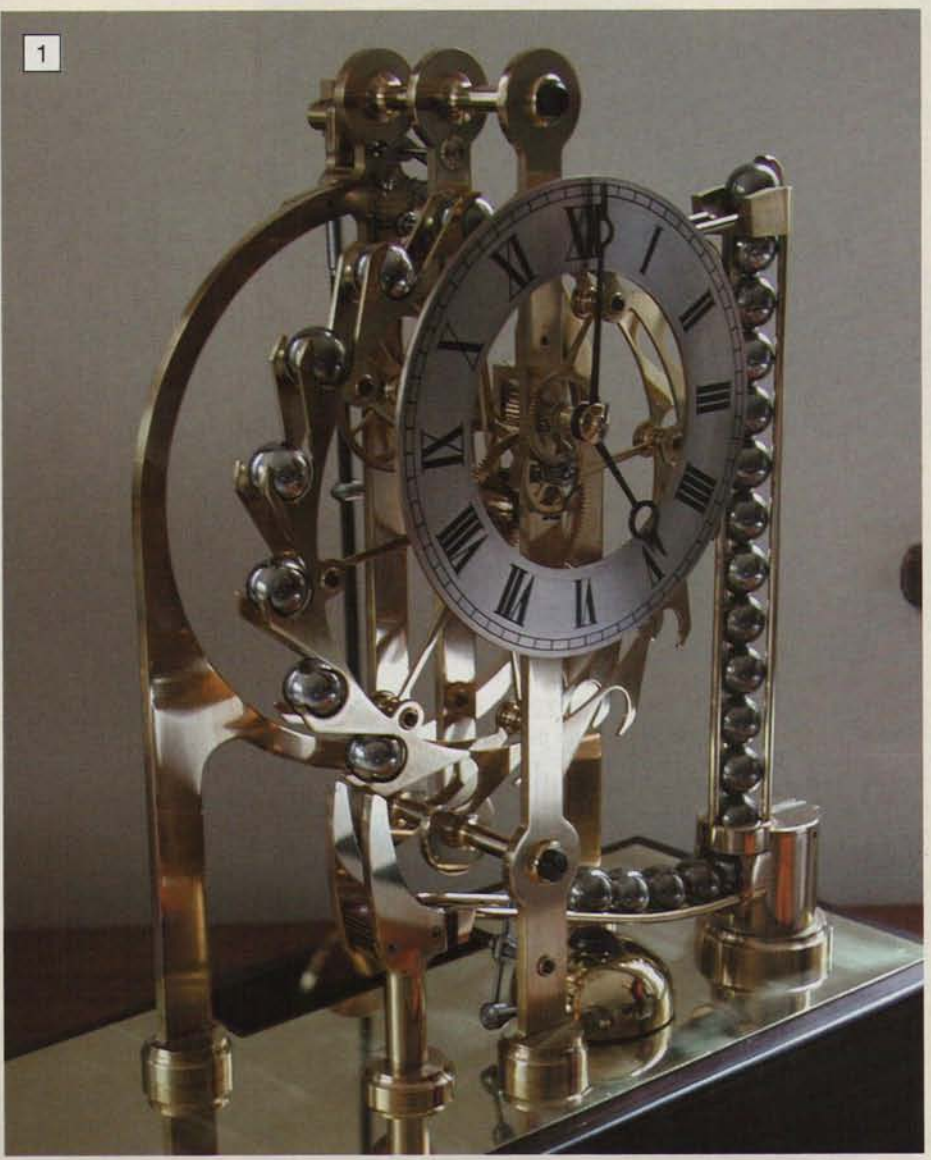
With its glass case removed for our photograph and resplendent in gleaming polished brass and stainless steel, this unique Ferris wheel clock will present a challenge to any prospective constructor.

The clock is powered by twenty-six 15mm dia. stainless steel balls. The Ferris wheel which holds the balls is furnished with 16 slots or receptacles around its circumference. At any one time 8 balls are held in the Ferris wheel to drive the train. The wheel rotates once every 4 hours; as a result, one ball drops off the wheel every 15 minutes. The ball drops onto a pair of contacts, closing a circuit and energising an electric motor. The motor drives an Archimedean screw which makes a single revolution and lifts one ball through 15mm, the diameter of a ball. In the process a ball is ejected from the top of the stack and rolls into a slot at the top of the wheel. When it drops off the wheel, the ball also actuates a quarter-hour chime. The remaining 18 balls are stored in the recycling mechanism.