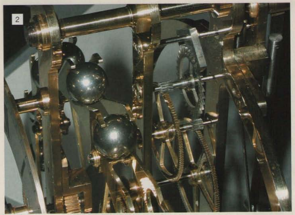
A tantalising glimpse at some of the detail work involved in the Ferris wheel clock.

The clock is mounted on a rectangular wooden base housing the geared motor which powers the ball lift, the electronic circuit board that controls the motor, and a tray containing four D-type cells which provide the power. Initially, I had wanted to power the ball lift mechanically using clockwork. I constructed a suitable drive mechanism using a reasonably powerful spring, only to find that it would only lift a maximum of three balls! The basic difficulty with springs is that, though they can store considerable potential energy, controlled release of this energy over an extended period can lead to problems.